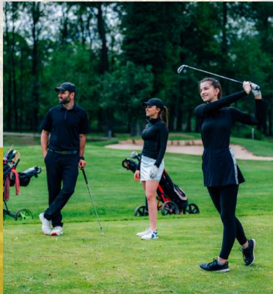
CELEBRITY SHOOTOUT SPONSORSHIP

The Super Celebrity Shootout 2025 offers a variety of additional promotional activities to help brands engage with a high-profile audience and create memorable experiences. These exclusive sponsorships and advertising opportunities enhance brand visibility and ensure your brand is seamlessly integrated into the event's exciting highlights.