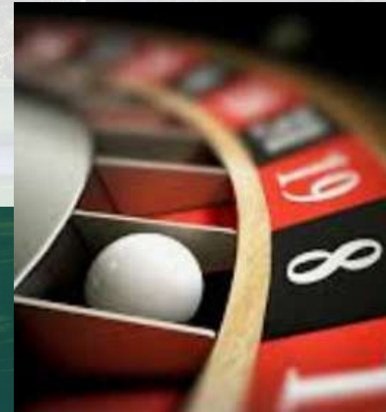
CASINO NIGHT AND PERFORMANCE(S) SPONSORSHIPS