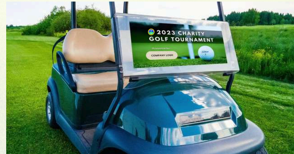
GOLF CART SPONSOR - $10,000.00