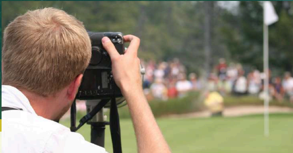
PERFORMANCE & STREAMING

Apart from our primary sponsorship packages, the Super Celebrity Shootout 2025 offers additional exclusive sponsorship opportunities. These packages are crafted to provide high-visibility brand exposure and create memorable experiences for attendees, ensuring your brand stands out and connects meaningfully with our audience. Choose from these unique sponsorships to elevate your brand presence.