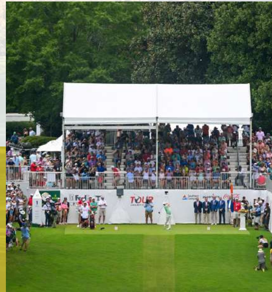
ADVERTISING & SPONSORSHIP FOR PERFORMANCE(S)