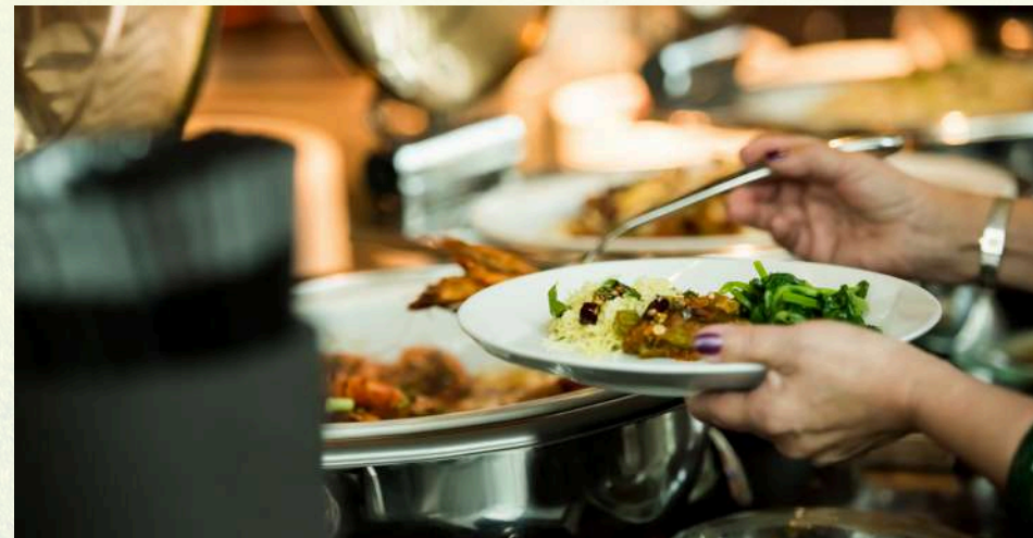
LUNCH SPONSOR- $10,000.00