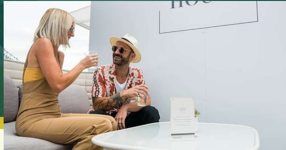
POP-UP LOUNGE EXPERIENCE