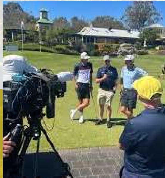
BROADCAST OR STREAMING DEALS